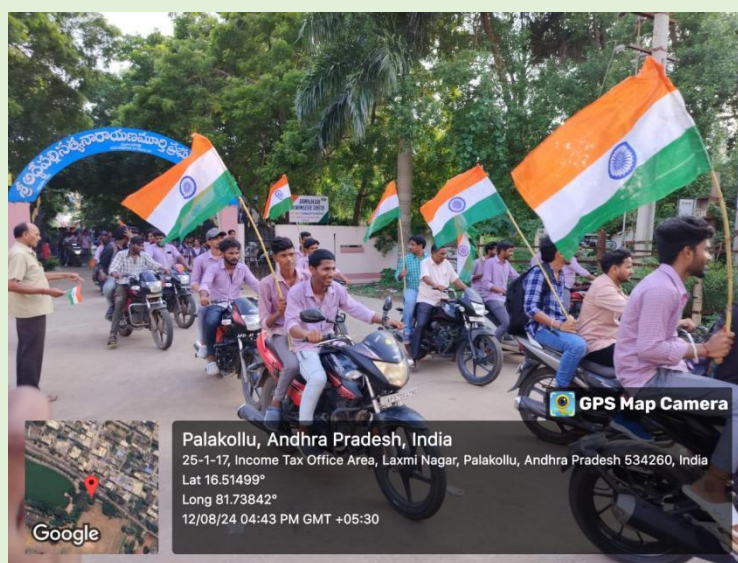
"Har Ghar Tiranga" Bike Rally by students and staff

The "Har Ghar Tiranga" Bike Rally was a dynamic and patriotic event aimed at promoting unity and national pride among participants and spectators alike. With riders waving the vibrant Indian tricolor, the rally journeyed through towns and villages, creating a visually inspiring spectacle that resonated deeply with citizens. This initiative was more than just a display of patriotism; it symbolized the collective strength and unity of the nation. Participants of all ages, from diverse backgrounds, joined hands to spread the message of togetherness and pride in India's rich heritage and democratic ideals. As the rally progressed, it became a moving celebration of freedom and national identity, evoking a sense of belonging and shared responsibility for the nation's progress. By reaching every corner, from bustling urban centers to serene rural landscapes, the rally reinforced the idea that the spirit of the tricolor unites us all, regardless of our differences, as proud citizens of India.